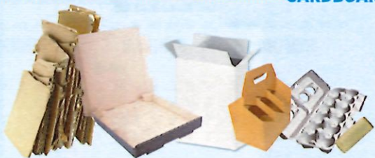
Cardboard & Boxboard (Clean & dry)