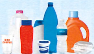
Plastic Bottles, Jugs, Tubs, & Lids (Empty kitchen, laundry, & bath containers & clamshells)